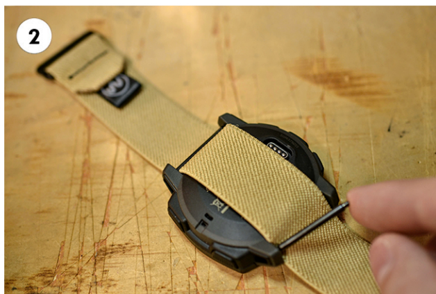
2) Install your new Hook Strap face down onto the rear of your watch using the original Garmin spring bars .