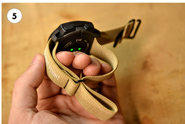
5) To wear, adjust the Slider up or down the length of the strap, extend the Loop to tighten the fit, slip your hand through the opening just beneath your watch, and secure the Hook onto the Loop once on the wrist.