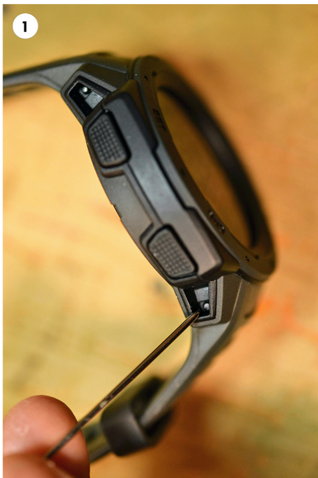
1) Remove the original strap with a pin by pushing in one end of the spring bar and pulling on the strap.