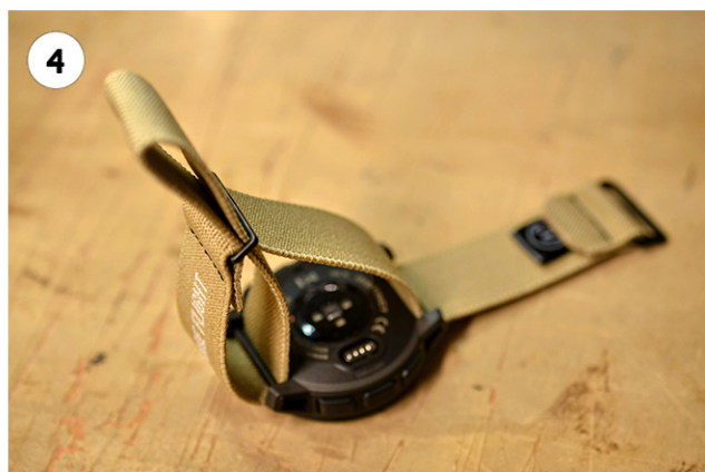
4) Pinch the end of the loop you just created, and insert it through the Slider found on the far end of the strap. This creates the Loop for which your Hook will attach to!